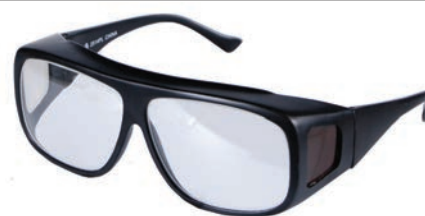
ITEM: LT400 Fitover

These frames are constructed of optical steel base metal electroplate. Each pair is made with an adjustable non-slip silicone nose pad for maximum comfort. Weight: 62 grams