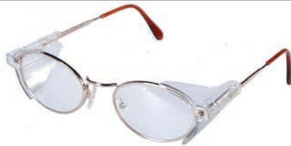
ITEM: LT600 MetalFlex

A lightweight, wrap-around nylon frame with built-in adjustable nose piece to distribute weight evenly over the nose. The earpieces are attached by spring hinges designed to withstand the rigors of hospital use. Weight: 85 grams