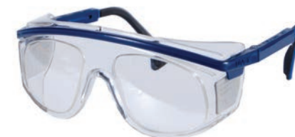
ITEM: LT300 Astro

A standard safety frame which offers excellent protection and large viewing area. Universal form fit bridge. Weight: 75 grams