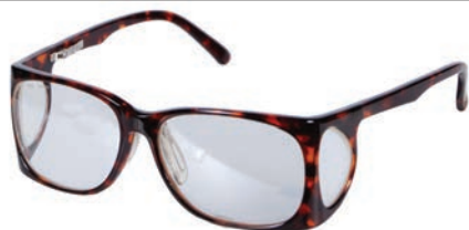
ITEM: LT5050 Wrap

These flexible safety frames can be adjusted for a more custom fit. The front of the frame is fitted snugly to the brow to help alleviate fluid run-off into the eyes. Weight: 75 grams