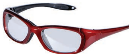
ITEM: LT500 Maxi

Manufactured of lightweight nylon and designed to provide protection for the entire eye area. The curved front and temple bar with rubber tips allow for a close secure fit. Available in Black, Silver, Red, and Carbon Gray. Weight: 58 grams