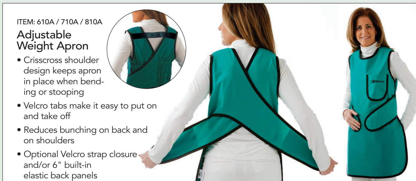
ITEM: 610A / 710A / 810A