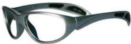
ITEM: LT100 Ultralite

All glasses are made with the highest quality SCHOTT glass and offer .75mm lead equivalency. Most styles are available in Single, Bifocal, and Progressive prescriptions.