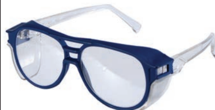
ITEM: LT200 Euro

The Maxi is slightly smaller than the Ultralite and includes a soft rubber nose bridge for increased comfort. Available in Black, Silver, Red, and Navy. Weight: 63 grams