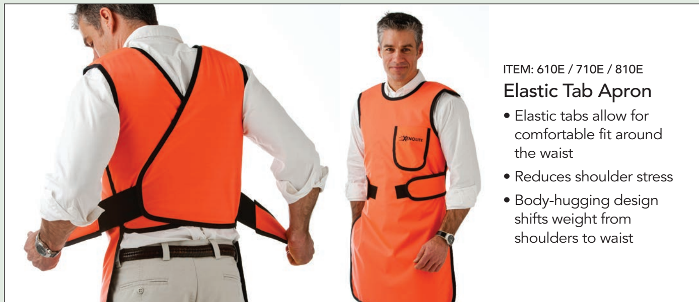
ITEM: 610E / 710E / 810E Elastic Tab Apron

To determine sizing, please see page 15.